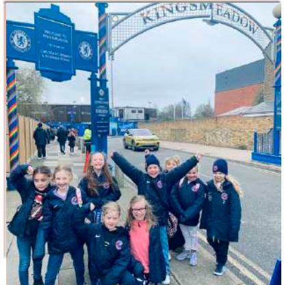
@Matt+CFC85 Fc Bracknell Lions enjoying a team day out at Kingsmeadow