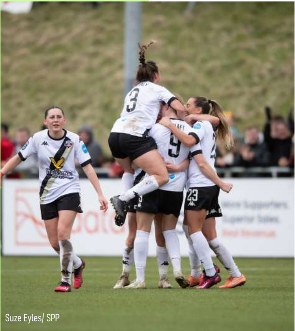
Suze Eyles/ SPP