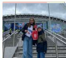
Hutchinson family at Wembley