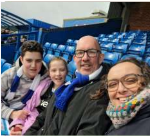
@KingmanSimon Chelsea season ticket holders vs man utd