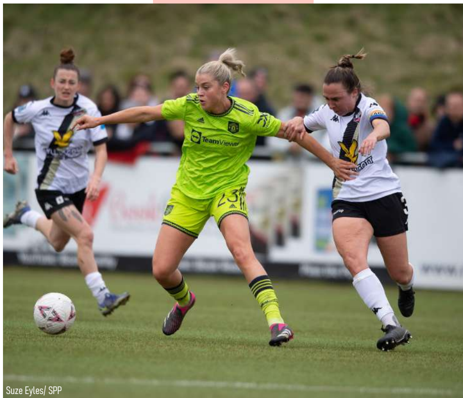
Suze Eyles/ SPP