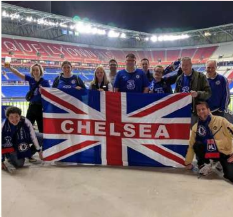
@HerGameToo Chelsea fans travel to Lyon