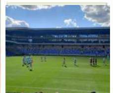
Paul D'Onegon at Scotland vs Australia

TO GET YOUR PICTURE IN 'TWFM' EMAIL HELEN@THEWOMENSFOOTBALLMAGAZINE.COM OR TAG US ON SOCIAL MEDIA @WOMENSFOOTIEMAG